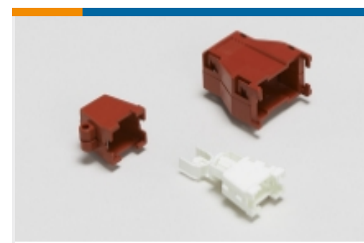
Rectangular Boots &amp; Strain Relief(1)